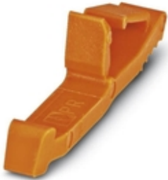
Latching, length: 29.8 mm, width: 4.4 mm, number of positions: 1, color: orange

Please be informed that the data shown in this PDF Document is generated from our Online Catalog. Please find the complete data in the user's documentation. Our General Terms of Use for Downloads are valid ( http://phoenixcontact.com/download )